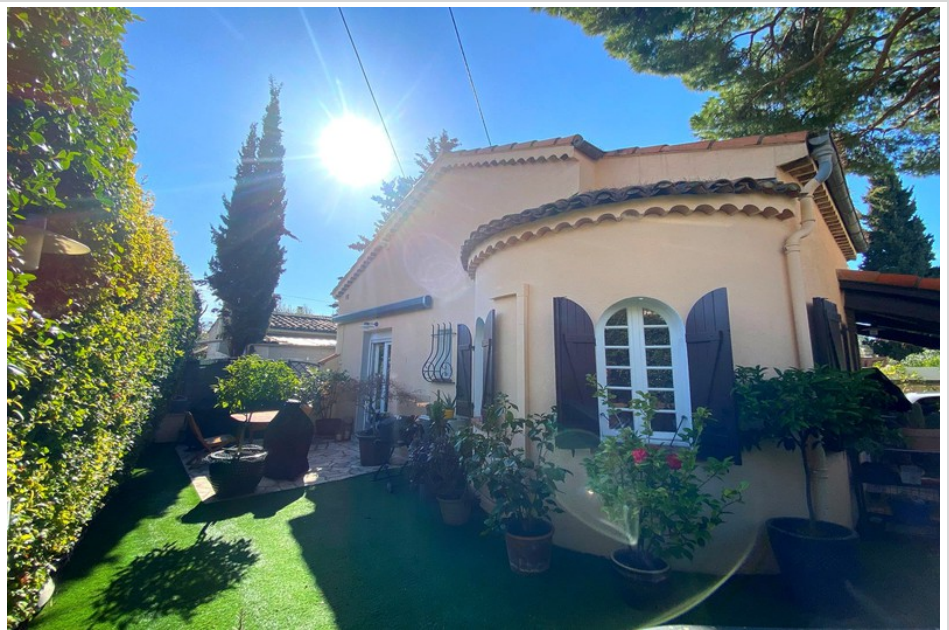
House 2862 Juan-les-Pins

Beautiful detached house, with a surface area of approximately 125 m 2 including 100 Carrez law, ideally located in the popular Pinède district of Juan-les-Pins. This single-storey property, perfectly maintained and renovated, offers an East-West orientation, ideal for optimal light throughout the day. With three bedrooms, one of which is upstairs, each bedroom has its own bathroom or shower room. The interior also offers a fully equipped and fitted independent kitchen. You will be charmed by the services offered: jacuzzi, fireplace, double glazing, automatic watering and gate and the choice of materials. Nestled on a plot of approximately 200 m 2 , the house offers a haven of tranquility with a view of the garden and its terrace. Parking and a garage complete this property. Heating by reversible air conditioning and electric hot water production. Calm and comfort await you.