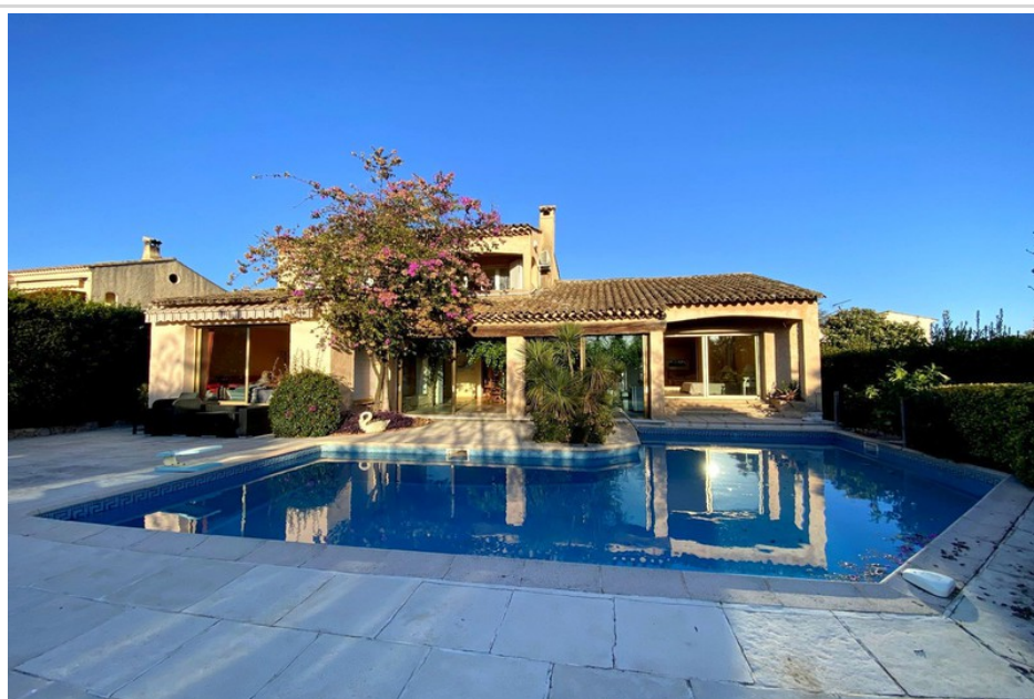
Villa 2631 Juan-les-Pins

JUAN-LES-PINS: a very well located villa 1 km from the beach with a pool, garage and private tennis court. This beautiful villa of 300 m² has a south terrace, a pool, a newly built tennis court and summer kitchen in a well-kept garden of 1980 m².